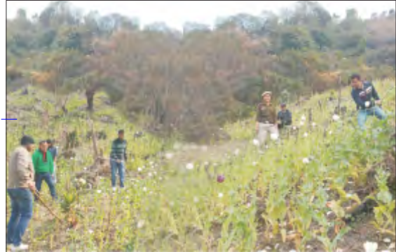
Destruction of Opium cultivation by Guwahati Zonal Unit